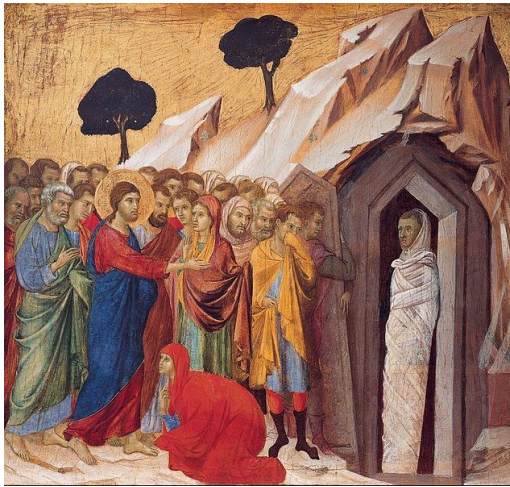
The Raising of Lazarus